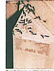
Photos showing the use of Ant Baits in a bait station.