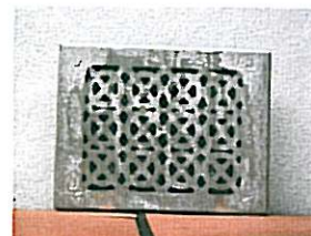
Heritage 2 Brick Solar Fan