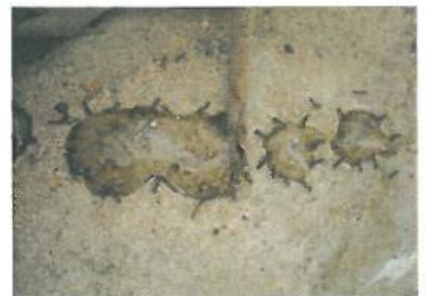
Ants feeding, on Ant Liquid Bait.