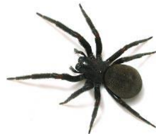
Black house spider and web